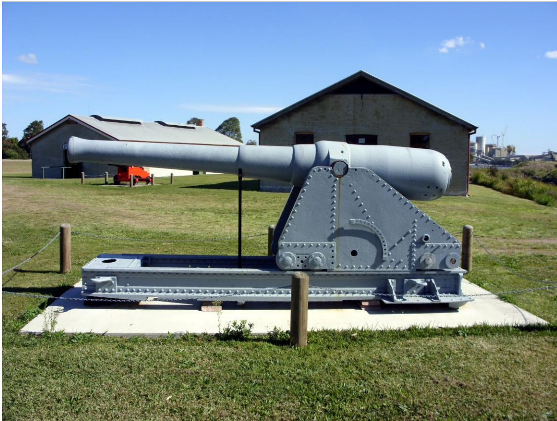
6 Inch Rifled Muzzle Loader converted to Breech Loading in its position today at Fort Lytton.

Two of these guns were purchased by the Queensland Government to act as the long range guns of Fort Lytton. They were emplaced in Gunpits 1 and 2 in 1883, fired for the first time in July 1884 and replaced by the disappearing guns in 1887, so as you can see they didn't last long at Fort Lytton. When they were replaced the barrels were sent back to England to be converted from muzzle loaders to breech loaders. Upon returning Queensland in 1890 the guns were sent to Townsville where it was envisaged that they would be emplaced in a coastal position for the defence of the port there. They were emplaced on Magazine Island and by 1892 they were operational using the original compressor plate recoil system. By 1895 they were deemed obsolete and it would have been too expensive to modify them further and in the early 1900's they were returned to Brisbane and were eventually used as targets on the range at Enoggera. They were then buried and in the 1960's one of the guns was dug up by a work party from 1 Field Regiment. In the late 1990's when restoration at Fort Lytton was in full swing the gun was returned to Fort Lytton and was lovingly restored by members of the Fort Lytton Historical Association and was put on display in the foyer of their canteen and museum. In the 2006 it was then moved by a National Parks and Wildlife party to its position near the moat at the entrance to the Fort.