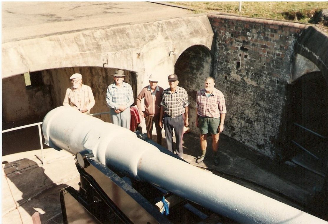
A group of the “oldtimers” in Gun Pit No 1 after placing the 6” Disappearing Gun barrel on its mounting.